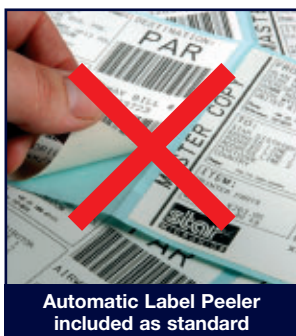
Automatic Label Peeler included as standard