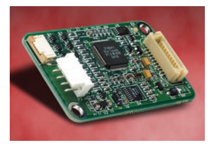
2216 combo controller board