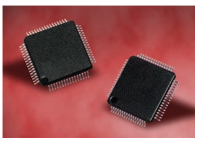
COACh III combo controller chip